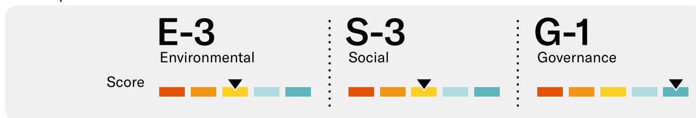
Exhibit 4 ESG issuer profile scores

Département de Seine-et-Marne's Environmental, Social, Governance (ESG) Credit Impact Score ( CIS-2 ) reflects moderately negative exposure to environmental and social risks, mitigated by very strong governance practices, as well as strong resilience to shocks thanks to its intrinsic financial strength, strong liquidity and external support (including central government support in case of major natural disaster).